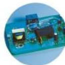
SmartGUARD™ Fire Alarm (Patented)